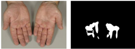
Figure 1. Labeled training image with hand photograph and eczema mask.

ters and interpolate the remaining values. This produces a prediction value in [0, 1] for every pixel to belong to an eczema region. Finally, a threshold is determined by ROC curve analysis as pointed out below in order to decide on each pixel's label.